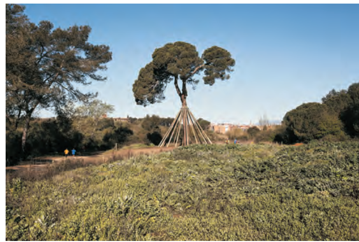
Pi d'en Xandri

Iglesia de origen románico pero muy transformada, con un relieve A heavily-modified Romanesque church with a gothic relief from 1447. With a rectangular footprint, it includes a barrel-vault and a bell-gable. This spot is extremely popular; every March 3rd the Aplec de Sant Medir, a traditional gathering in honour of one of the patrons of the city, is held here.