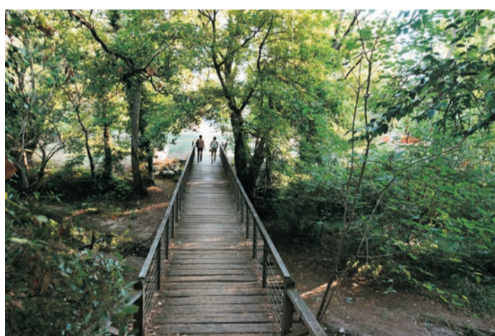
Pond of Can Borrell