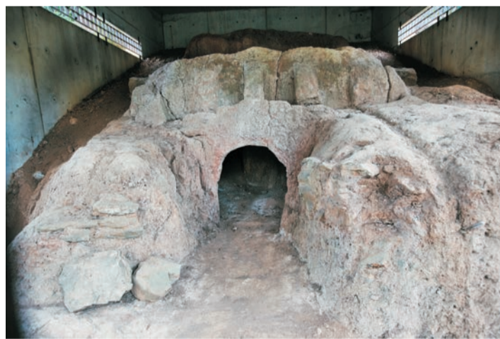
Kiln of Sant Adjutori