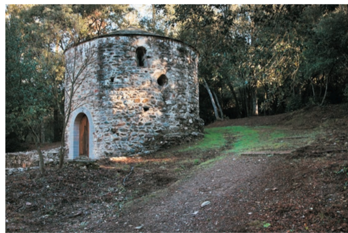
Church of Sant Adjutori