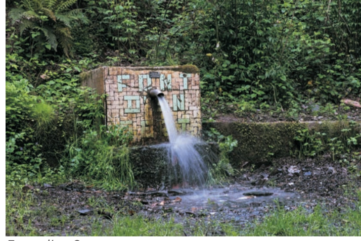
Font d'en Sert