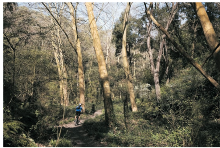
Font Groga Nature Reserve

A spring located at the upper end of the nature reserve that bears its name. Semi-circular, rendered cement benches sit on either side with a slight modernista air. Meaning 'yellow spring' this spot gets its name from the abundance of iron in the water.