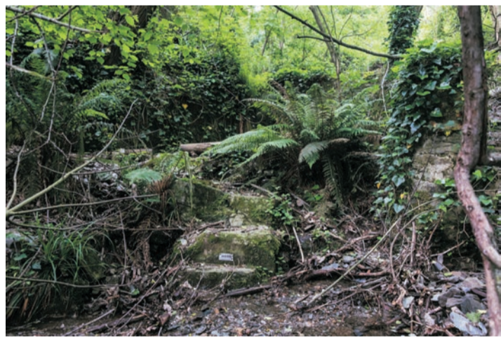
Font de l'Estrangulador