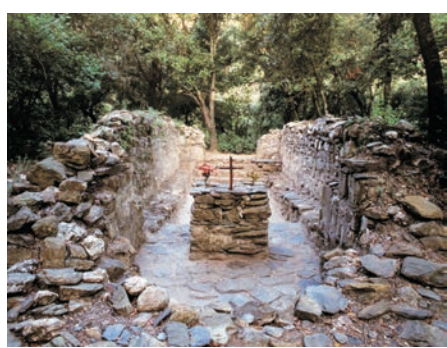
Church of Sant Vicenç del Bosc