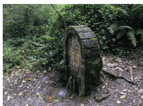
Font de Sant Vicenç del Bosc

Located in a valley called the Vall de Gausac, this farmhouse lies halfway along the traditional road from Sant Cugat to Sant Medir. The current structure dates to the 18th century. Nearby sits the pond of Can Borrell, which collected water that was redirected to the farmhouse for agricultural uses.